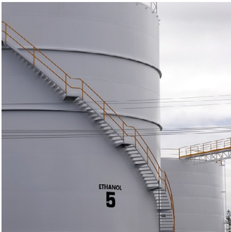
Strong offers cost-effective recycling processes for waste alcohols and many other materials.

Strong's unique, approved process allows for reduction of costs, while providing a waste alcohol reuse solution. What one generator considers a waste for disposal can be used as a raw material by another manufacturer or in another process.